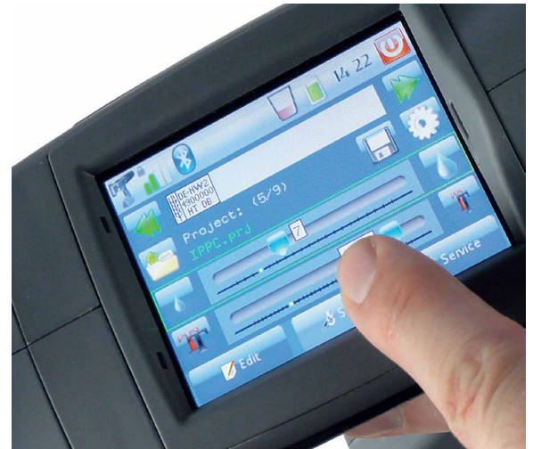
Control and input via touchscreen

For more information on the reimagined HandJet EBS-260, contact EBS Ink-Jet Systems at 847-996-0739 or america@ebs-inkjet.com .